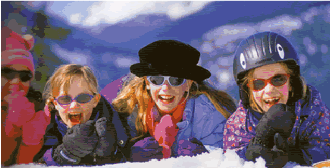
Fun in the snow for all ages