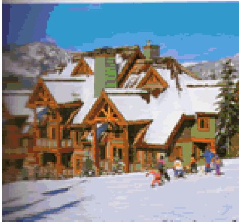
Ski-in ski-out on Blackcomb

idea to plan your arrival and departure around the camps you want your child - or yourself - to attend. Lift passes are available in seven of eight days, eight of nine days, 10 of 12 days, and 11 of 13 days formats - giving you some time off the slopes to enjoy Whistler's other activities. Passes vary in price depending on the number of days but average at C$65 per day - based on a nine-day pass. There is a variety of different ski school programmes for both skiers and snowboarders to suit every skier level. So whether you're just starting out, or you need a personal guide to show you some hidden runs, there's something for everyone.